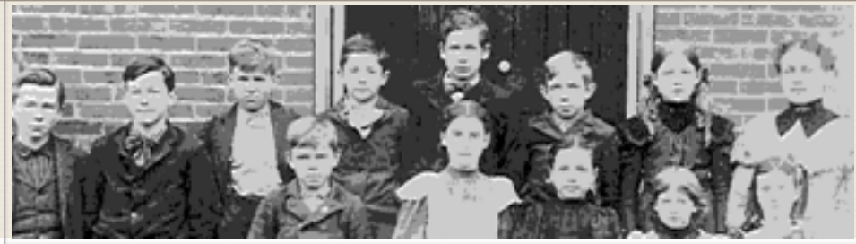
Cornell School Class of 1894

The schoolmarms of Cornell School look forward to your participation in their One-Room School Program. In order to make your experience as authentic, educational and enriching as possible, we ask that you remember that the experience will be a re-enactment, as lifelike as possible, of a typical school day in early 1900's.